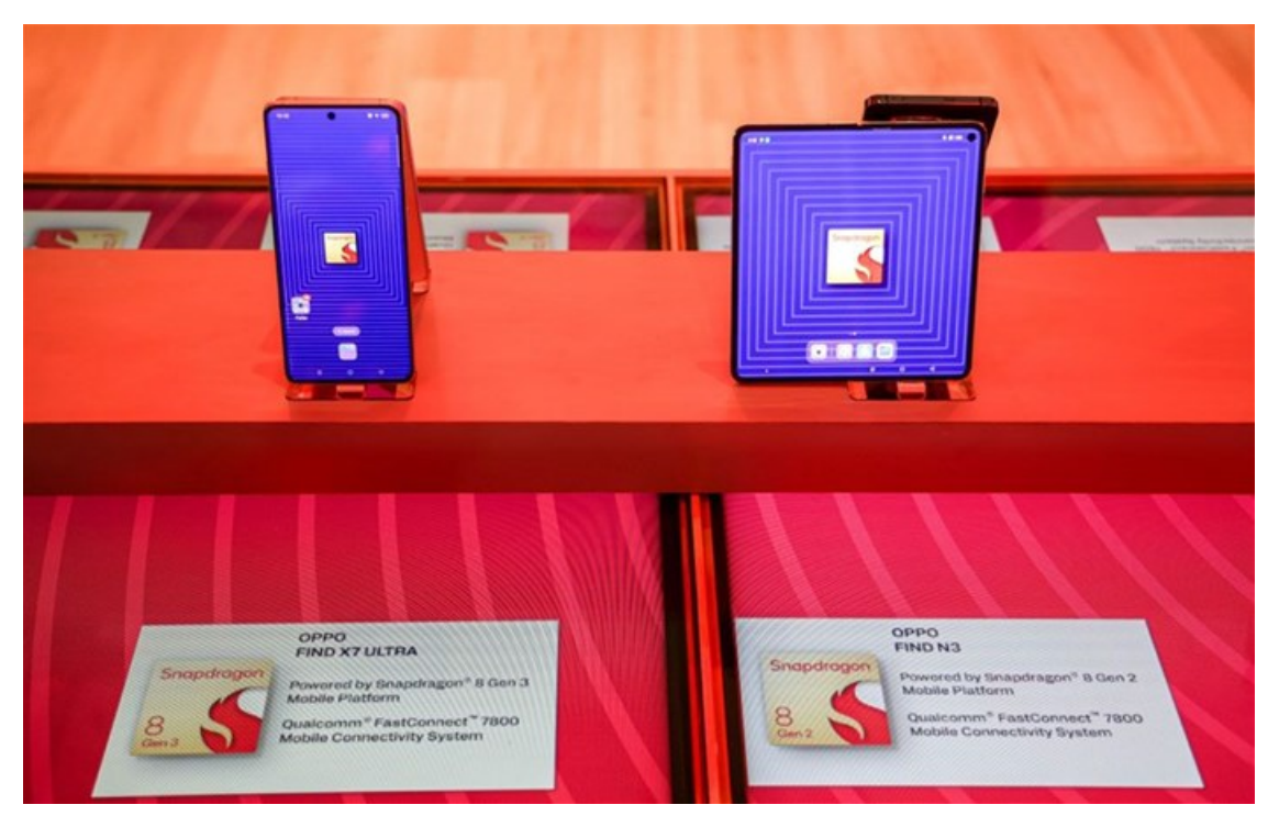
Oppo Find X7 Utra and Oppo Find N3 at Qualcomm booth

Meanwhile, a series of Oppo innovative products, including the Oppo Find X7 Ultra and the Find N3 series, is also being showcased at Google's Android Partner Walk, demonstrating the comprehensive cooperation between Oppo and Google in creating smarter user experiences over the years.