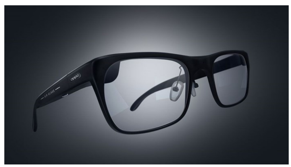
Oppo Air Glass 3 prototype

Weighing just 50 grams, the Oppo Air Glass 3 features a self-developed resin waveguide with a refractive index of 1.70, a display brightness uniformity of more than 50%, and a peak eye brightness of more than 1,000 nits. Together, these ensure the Oppo Air Glass 3 provides a wearing experience that is close to that of a regular pair of glasses while also providing the best full-colour display of its kind. Thanks to the access to Oppo AndesGPT provided by the Air Glass APP on the smartphone, users only need to lightly press the temple of the Oppo Air Glass 3 to activate the AI voice assistant and begin performing a range of tasks.