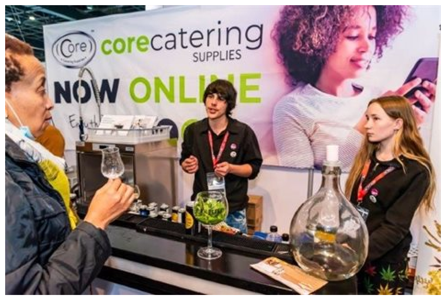
Core Catering at Hostex