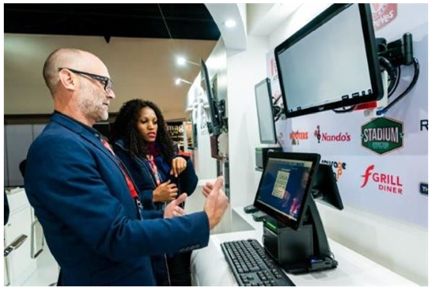
GAAP at Hostex

Renowned as a launchpad for new products, Hostex visitors will be greeted by an array of innovations. These and other