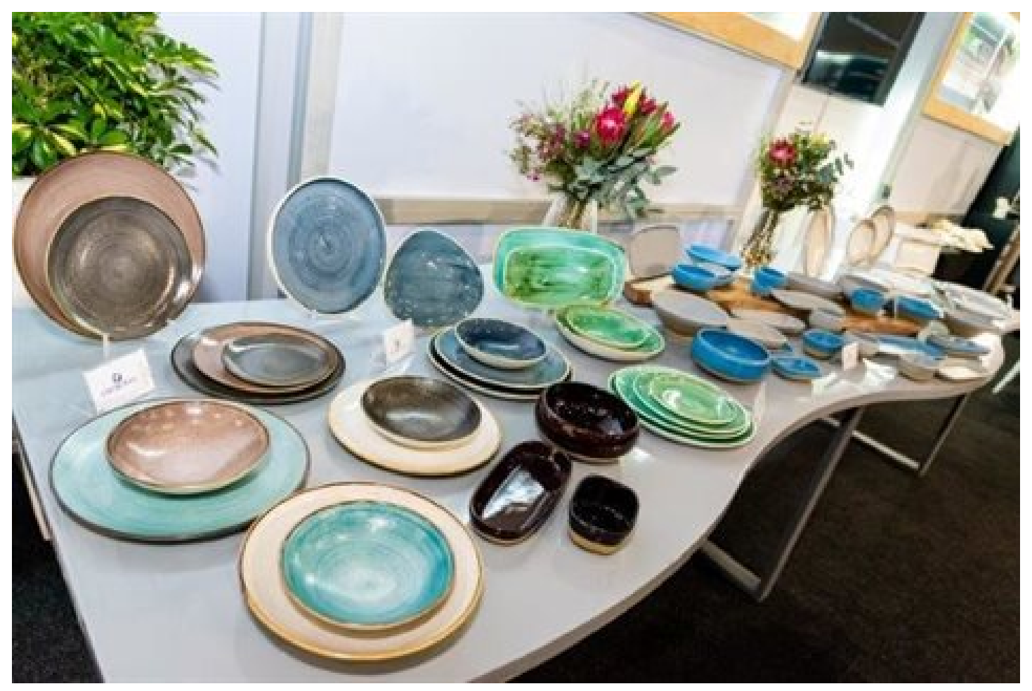
BCE at Hostex

With a 38-year legacy of fostering industry connections, Hostex is poised to once again showcase innovation in every aisle. Over 70 exhibitors will present their product ranges and services, finely tuned to meet the evolving needs of a dynamic industry primed for growth. Among them are a variety of first-time exhibitors and leading companies with new product launches promising cutting-edge solutions waiting to be discovered. Among the top brands exhibiting at Hostex 2024 are Adriatic, Core Catering, FoodServ Solutions, BCE, Morrico, Vulcan Catering & Bakery Equipment and Koldserve/Equipment Café.