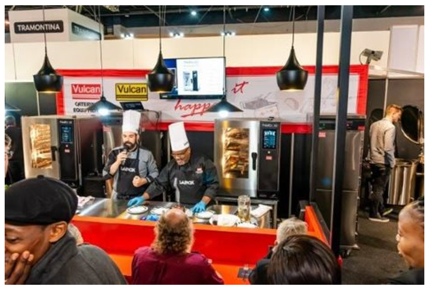
Vulcan Catering & Bakery Equipment at Hostex

Hostex 2024 promises several highlights: