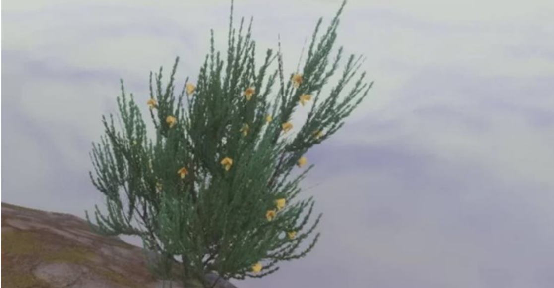
Rooibos appears in the game as the bush in summer bloom

Rooibos, a plant native to the botanically diverse Cederberg region of the Western Cape, has found a new home in the virtual world. The plant, which has been grown exclusively in this region for over a century, is now featured in the action-packed survival game, Enshrouded .