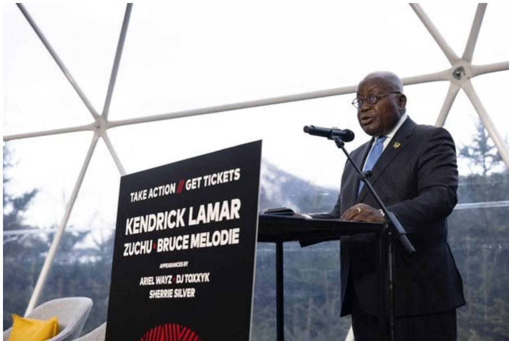
His Excellency, President Nana Akufo-Addo addresses the audience at the World Economic Forum in Davos inside the Forbes Dome during the announcement of the Ghana partnership with Move Afrika: A Global Citizen Experience.

Over time, these events will increase demand from international and regional artists to tour the region, and build local capacity, create jobs and scale the live entertainment sector within host cities.