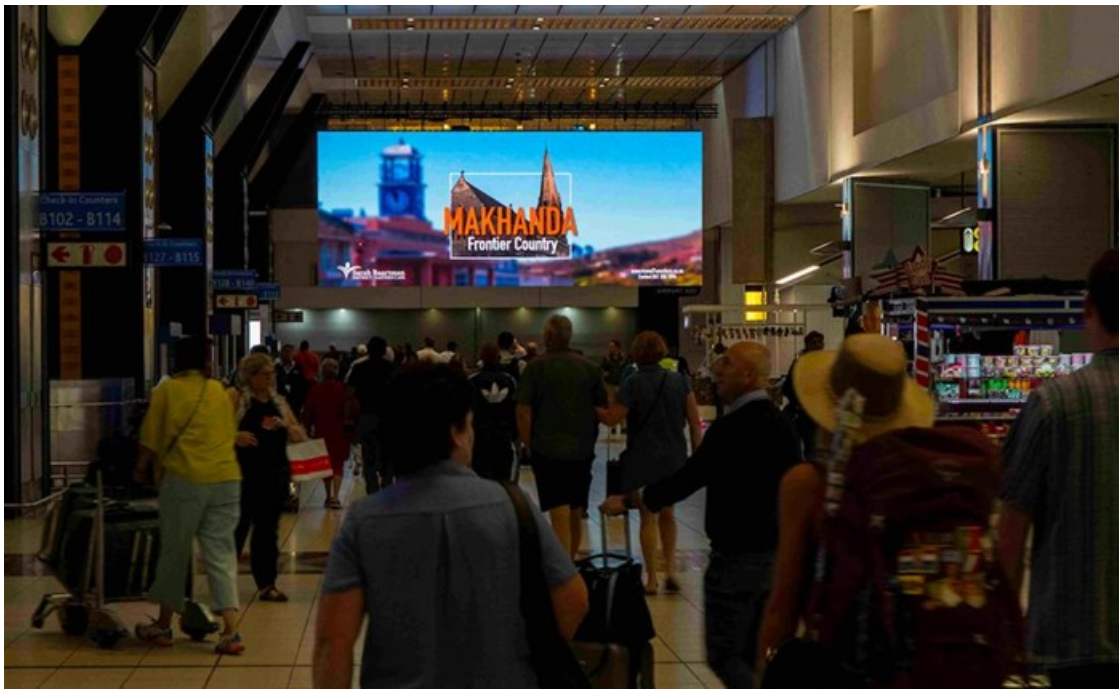
OR Tambo Airport

Deliwe adds: “Visionet’s greatest strength is that it offers all the advantages of digital OOH on a large high-impact screen with a particular demographic in view. Another key factor in Visionet’s success is its built-in capacity to adapt content for specific locations. This feature allows brands to deliver contextually relevant messages, enhancing their campaigns’ overall impact and engagement. Mobile integration adds an extra dimension to engagement.”