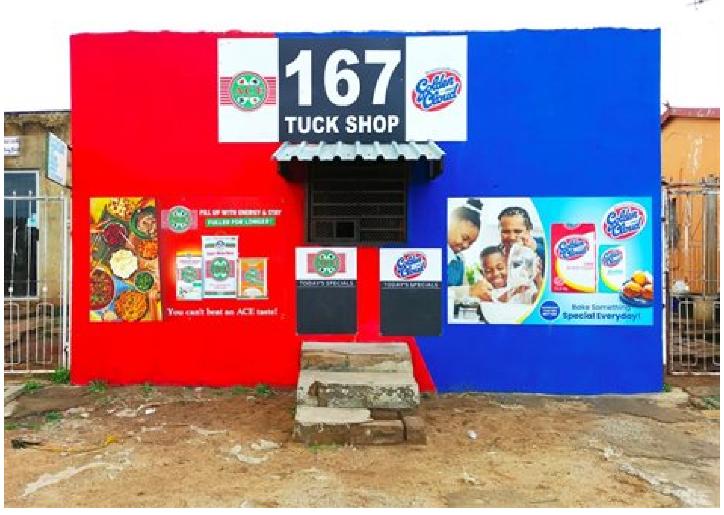
After - Golden Cloud and Ace spaza branding