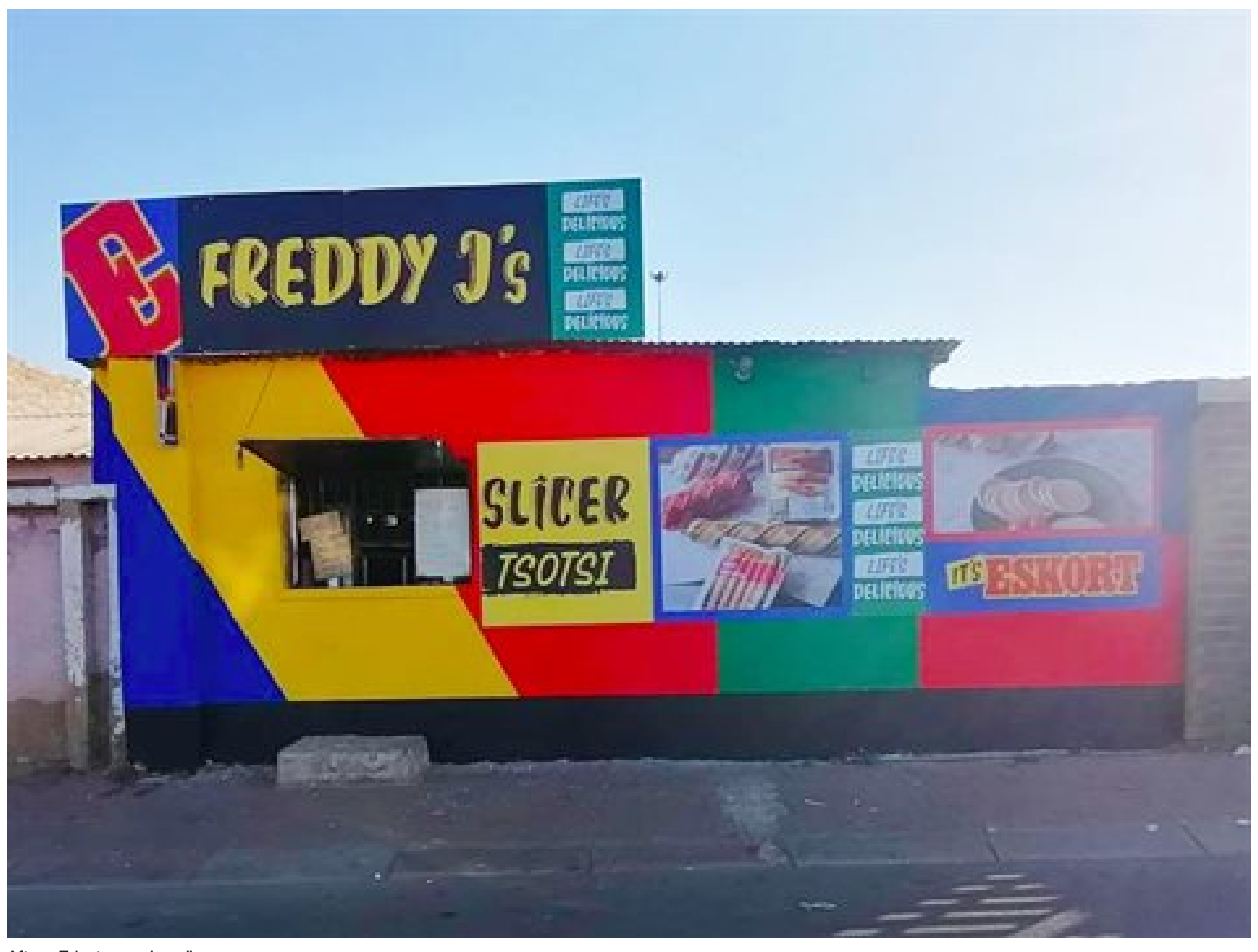
After - Eskort spaza branding