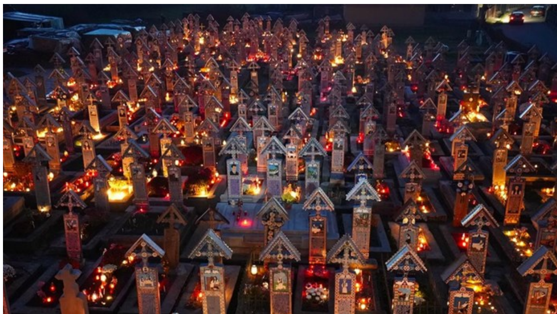
Europe from Above

Fan-favourite survivalist Bear Grylls is back with Running Wild With Bear Grylls: The Challenge . Premiering on National Geographic on Wednesday 28 September at 9pm, Bear takes the daring adventures up a level by teaching celebrity guests, such as Natalie Portman, Ashton Kutcher, Simu Liu, Anthony Anderson and others, essential survival skills that they will have to master and then prove they can use in a high-stress situation.