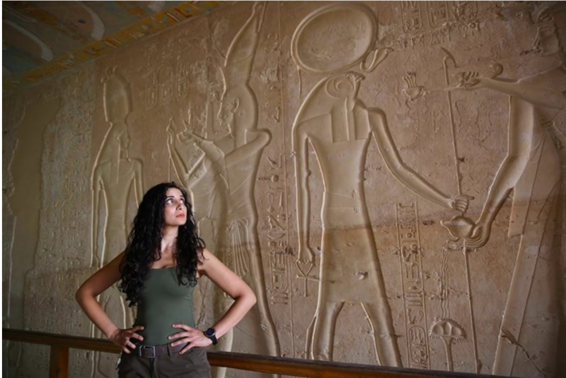
Tut's Toxic Tomb

In Lost Treasures Of Arabia , premiering Friday 28 October at 7pm, we investigate AlUla's unsolved mysteries and unravel the many dramas that played out on this ancient stage. This television special features reveals the historical heritage, exquisite natural assets and the immense legacy of art that continues to inspire future generations in this middle eastern city.