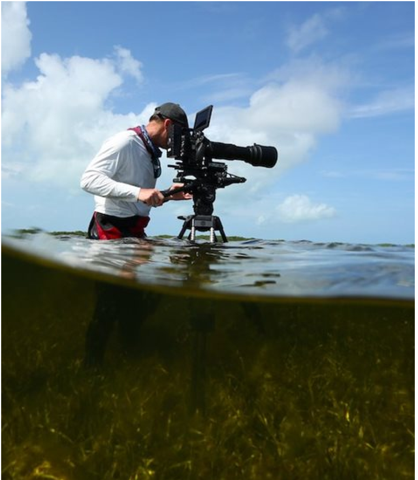
America's National Parks

The Walt Disney Company Africa today announced the upcoming content slate for both National Geographic and National Geographic Wild for spring/summer 2022. With a promise to ignite the explorer in all of us, and with a 133-year legacy, viewers across the continent will also be able to immerse themselves in the very latest and ground-breaking storytelling in stunning high definition for the very first time, taking them further than ever before.