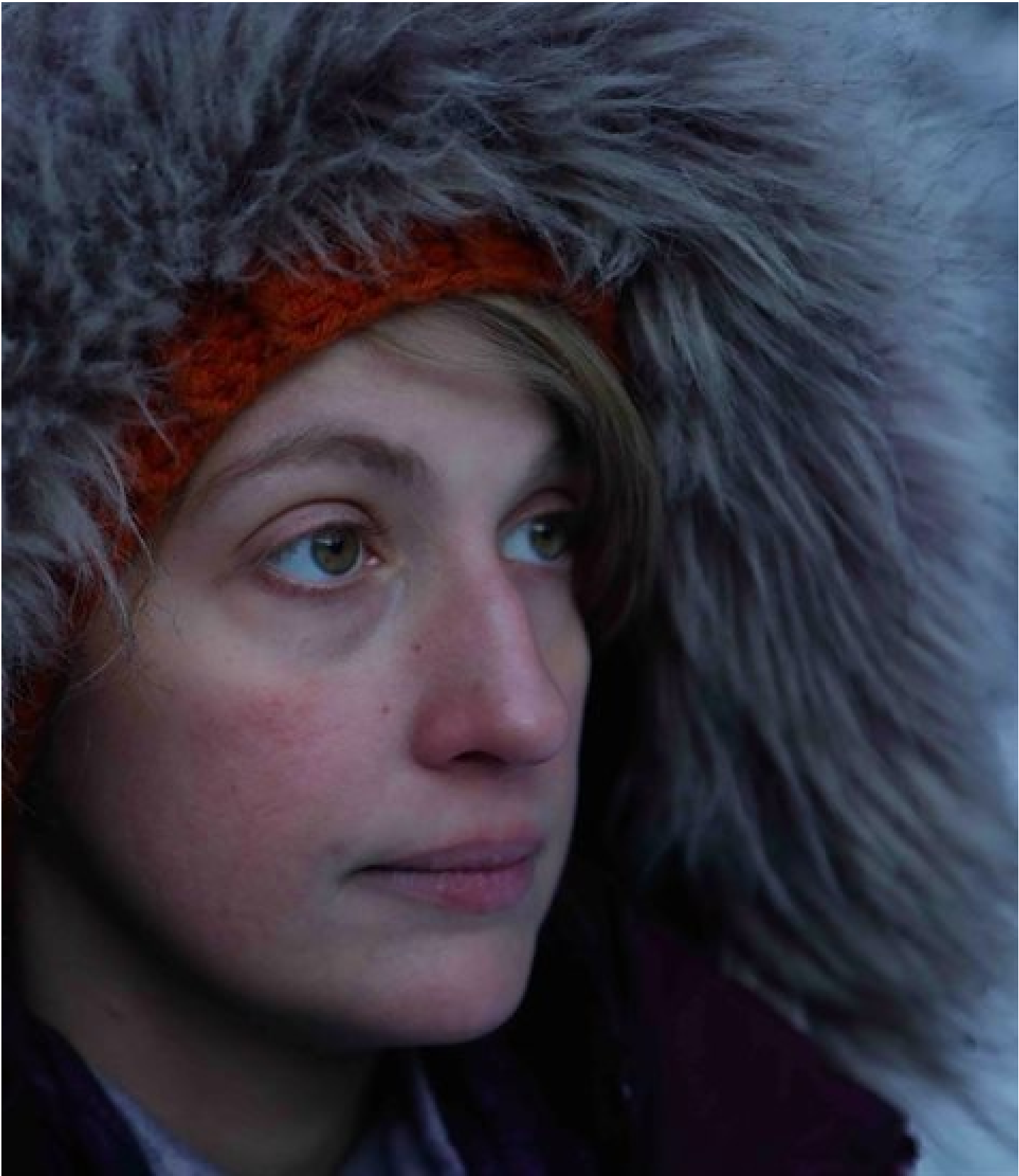
Alaska The Next Generation