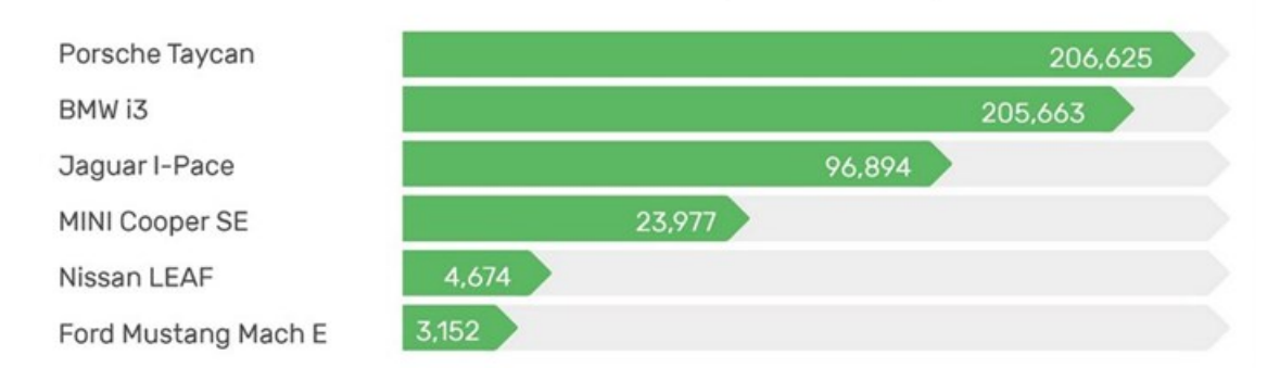
Top 6 EV Model Consumer Consideration

Electric cars that received the highest search volumes across the calendar year 2021