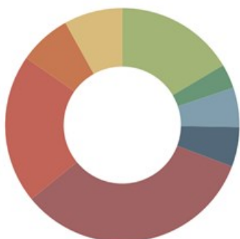
Projected mobile network operator revenue from A2P RCS traffic in 2025.

A2P messaging, which involves sending texts from a business-operated software application to a consumer's device, is emerging as a game-changer in the digital communication landscape.