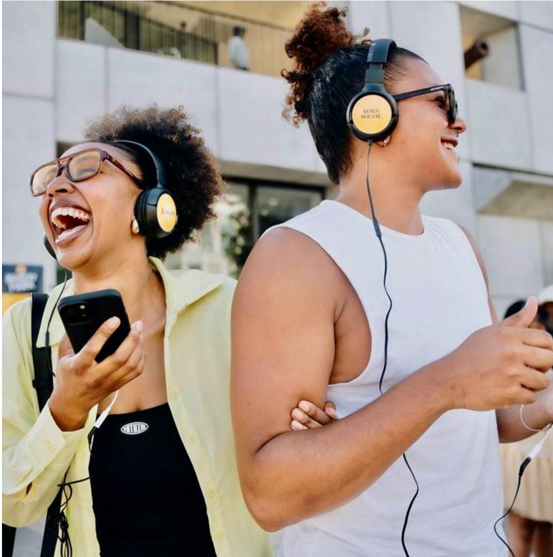
Schweppes' The Social Sound activation in Cape Town transformed a routine Instagram live-stream call-to-action into a real-life treasure hunt

Schweppes' latest innovation, The Social Sound took music lovers' everyday strolls into an immersive and vibrant musical journey to a secret location to be part of an exclusive music event.