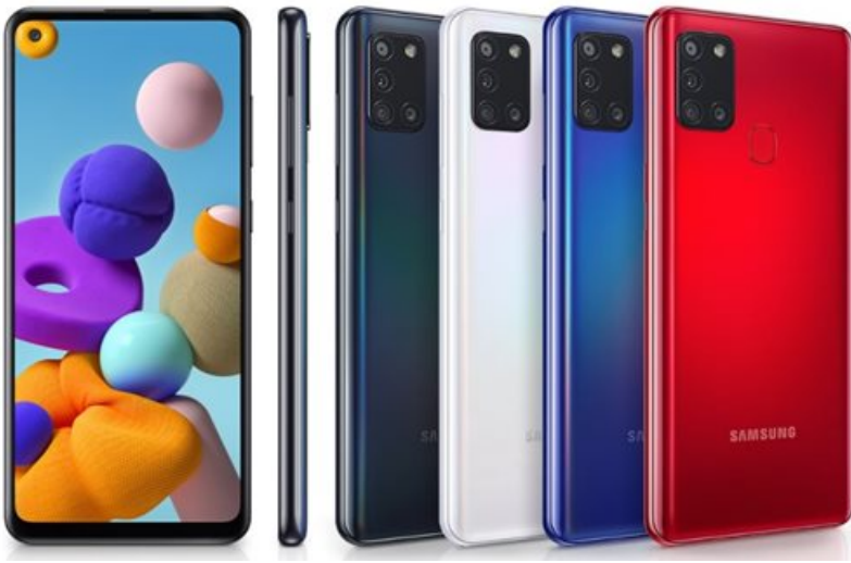
Samsung A21s.

Battery life is the A21s' strength. This device comes equipped with a massive 5,000mAh battery cell that delivers up to two days of battery life with moderate to light use. It also offers a large display, solid daylight photography and design-wise, it's easy on the eye.