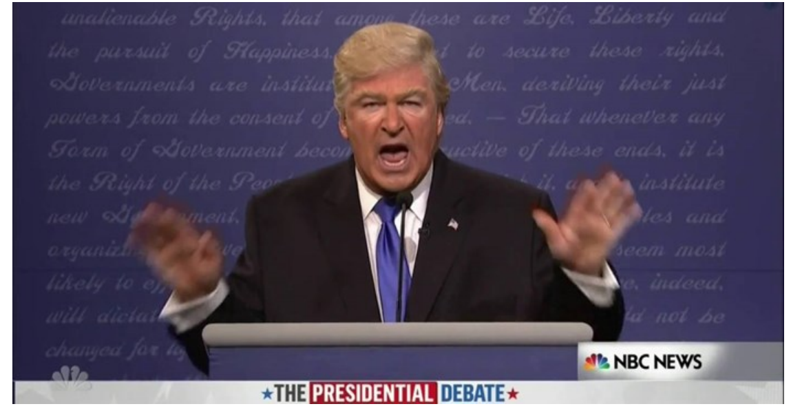
Alec Baldwin portrays Donald Trump on SNL Live.

One of the most (only) heart-warming moments of what has turned into arguably the most vicious Presidential election in the history of the United States, has come from its nice neighbour, Canada. Feeling sorry for a nation battered by a rabid Donald Trump, Canadians told America it's not that bad with a new campaign #tellamericaitsgreat.