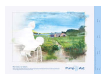
South Africa's Young Lion Print Competition entry.