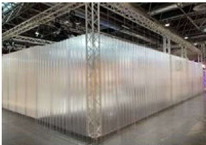
Semi-transparent materials, showing movement and activity inside stand.