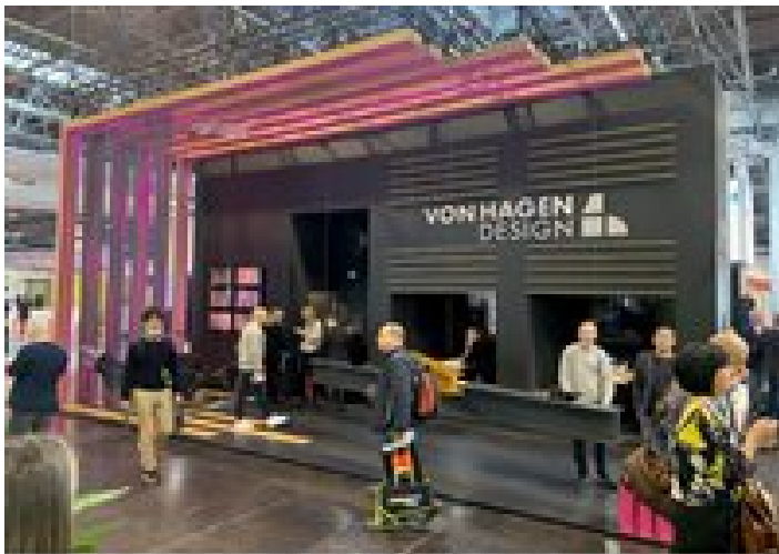
Clever floating l-beams defying gravity