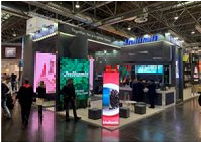
Screens, screens and more screens.