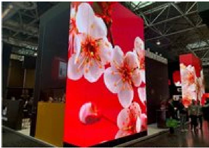
The graphics are all LED screens, with eye-catching changing content.