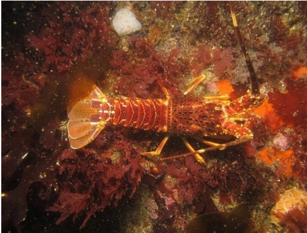
West Coast Rock Lobster