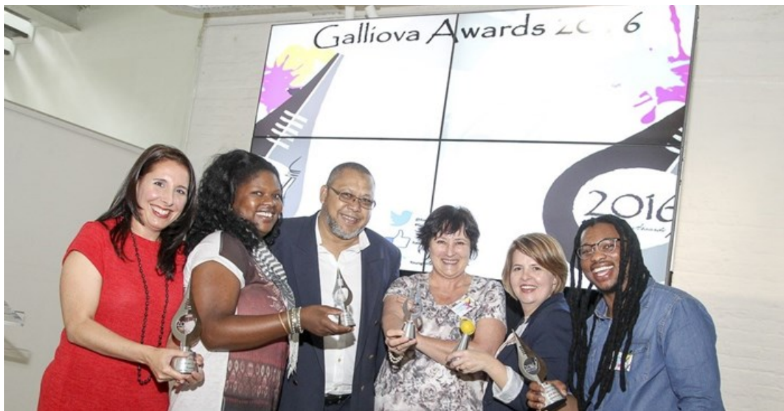
All the category winners.