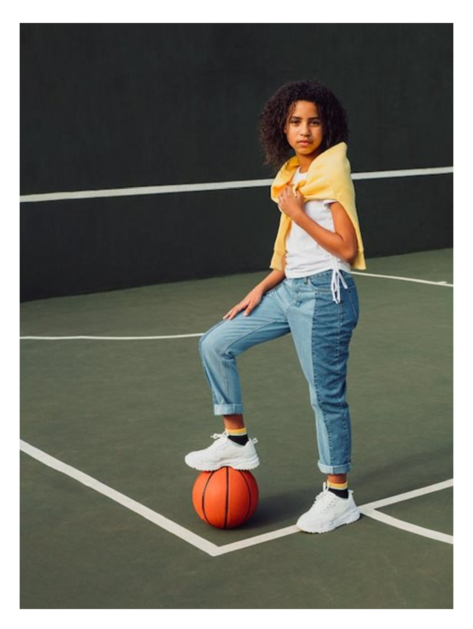
Sneakers are fast becoming a staple wardrobe item in the adult shoe category, providing people with the ability to invest in a pair that is suitable for both work and leisure, and fashionable yet durable, offering greater usage over a longer time