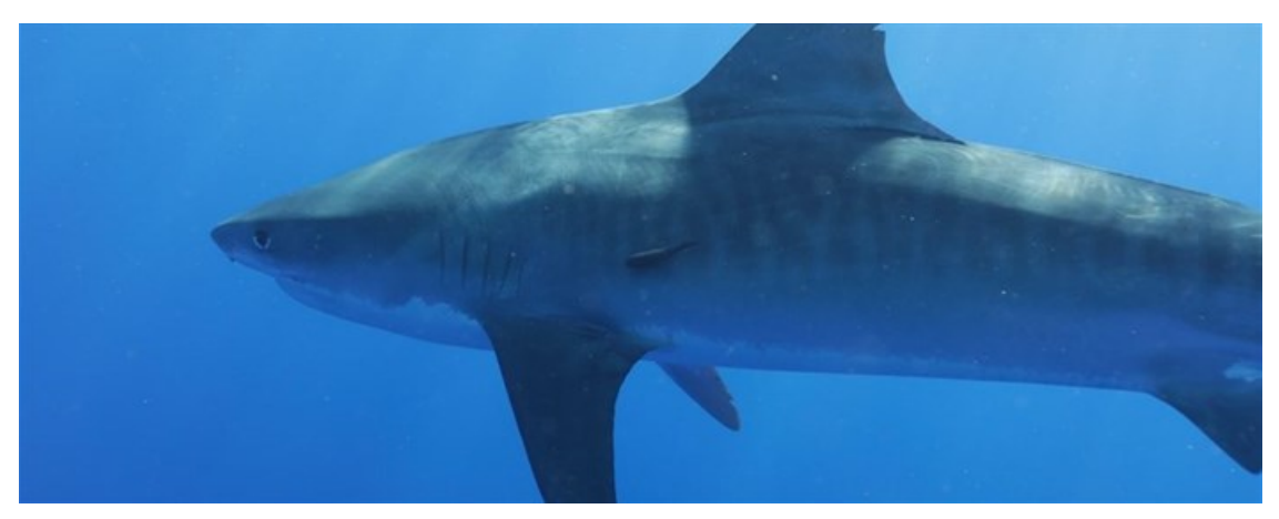
Maui Shark Mystery

Big and dangerous predators are invading unexpected waters, from golf courses and swimming pools to lakes and backyard keys. Through analysing user-generated footage, shark experts get to the bottom of how and why sharks seem more willing than ever to meet us on our own turf. In a bizarre twist, people encountering sharks in unexpected places are called to urgent action.