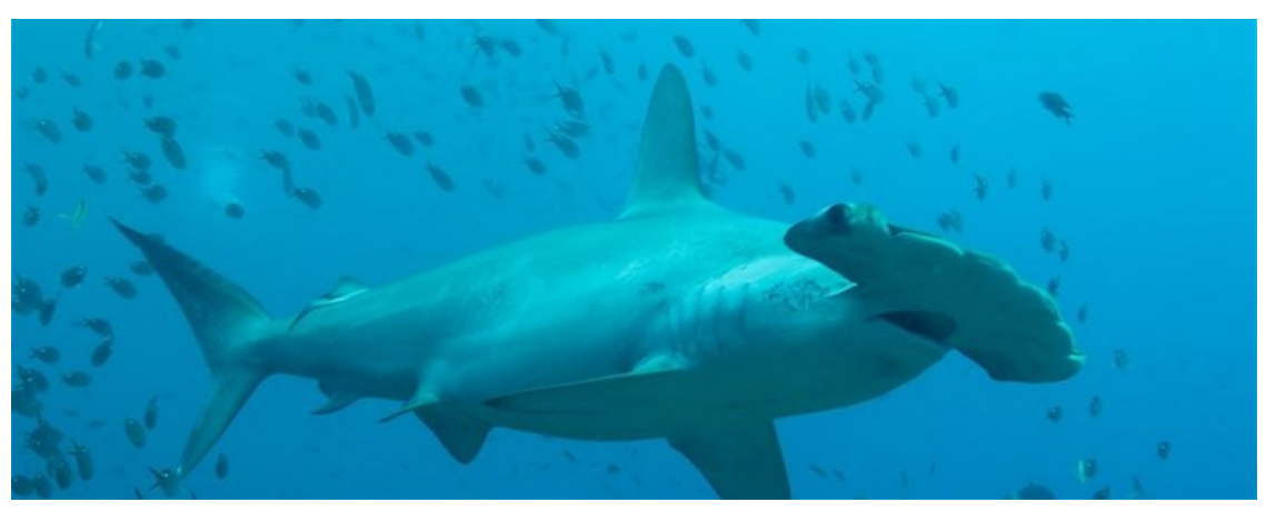
Shark Side of the Moon