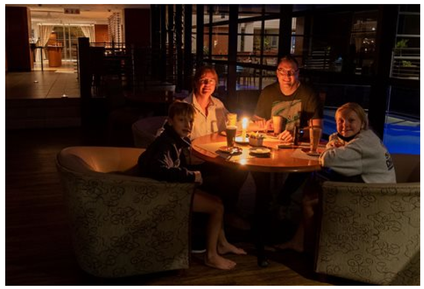
Hot chocolate at Oty Lodge Hotel at Ortia, Earth Hour 2022