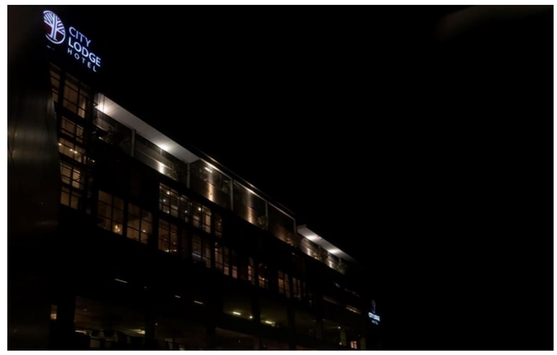
Oty Lodge Hotel at Ortia, Earth Hour 2022

When you take part in Earth Hour, you are joining likeminded people from around the world. Organised by the World Wide Fund for Nature (WWF), this initiative encourages individuals, communities, corporates and households to turn off their lights for one hour from 8:30pm to 9:30pm on the last Saturday of March, in support of and to raise awareness for the need to protect nature and tackle the climate crisis.