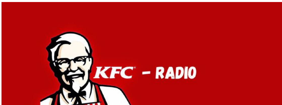
KFC - "Good burns vs Bad burns"

Check out the award-winning campaign below: