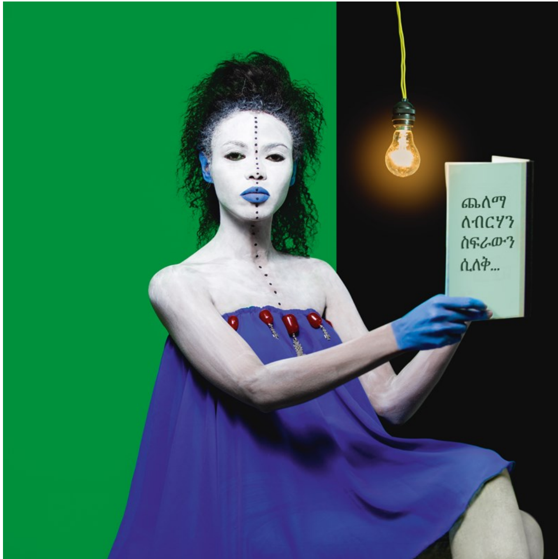
Aida Muluneh - Darkness Give Way to Light

The gallery will present 54 unique artworks, each created by an artist from a different African country, under the theme of “The Light of Africa”.