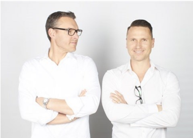
The Promise head honchos