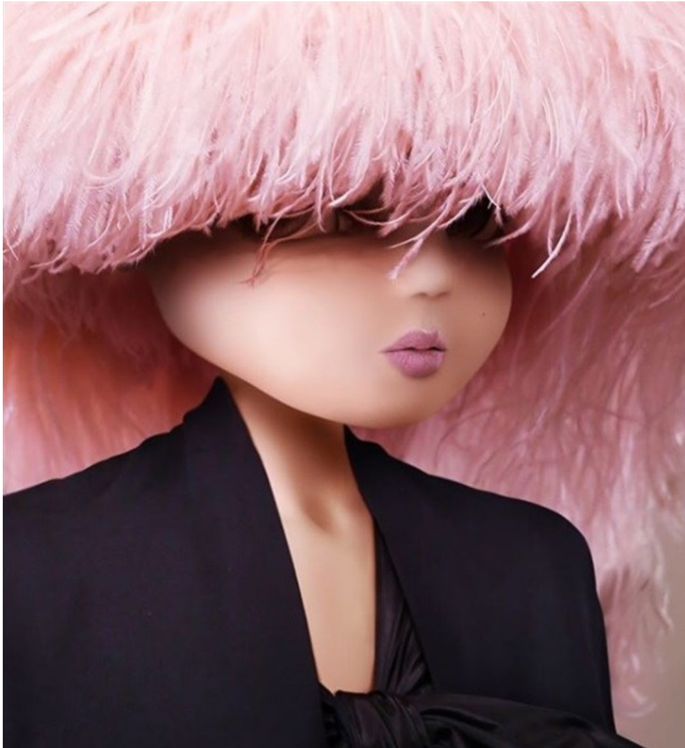
Noonouri in Valentino.

Immaculately-dressed, globe-trotting and adorably doll-like, Noonouri has made an enviable splash in the world of high fashion - but she only exists on the web.