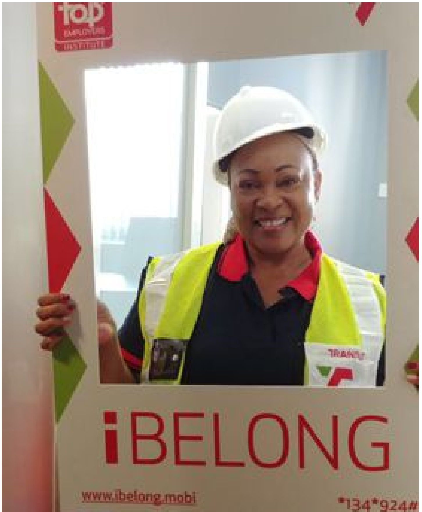
Transnet "iBelong" Employer Branding

Sathekgem continues: "Empowered employees are confident to take action, and most importantly have the authority to do so. Our Leadership is committed to inspiring and empowering employees to take action to serve our customers, a critical part of why we exist. We value our people and enable them to grow through outstanding training and development programmes that will allow them to add value too, and become an invaluable asset to us and to our country. In this high performance and enabling environment, our total reward structures are market-leading and we encourage and recognise our employees for excellence and their innovation."