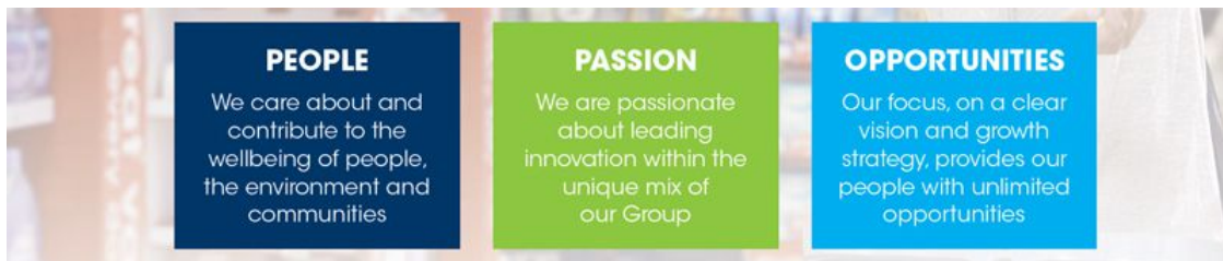
The Clicks Group Employer Branding Pillars

Measuring the success of their employer branding activities has proven to put the Clicks Group in good stead with the organisation achieving seven Top Employer Certifications . The Clicks Group has shared its wealth with 10% of its issued share capital in the hands of their employee share trust. The Clicks Group has also made a R95 million investment in the development of our employees as well as having R22 million spent on sustainable community initiatives in 2016 alone.